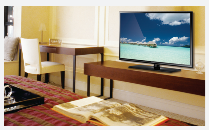
Figure 1. HC470 Series display contributes to a pleasant room ambiance and superior viewing experience with the modern, streamlined design

High-quality displays in guest rooms can contribute to an enjoyable hotel stay. With the modern design of Samsung HC470 Series displays, hoteliers can elevate guests' viewing experience. Light and unobtrusive, the displays feature a narrow. Bezel, providing more viewing area. Such details bring hotel guests a richer viewing experience and improve the hotel brand.