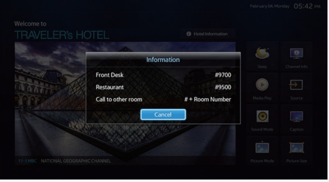
Figure 4. Guests can access the welcome message and hotel information easily through the Hospitality Home Menu