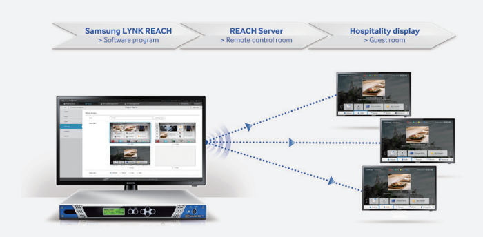
Figure 2. The REACH server allows hoteliers to manage several hundred hospitality displays remotely

The REACH server provides a straightforward way to manage several hundred hospitality displays remotely. This system helps reduce labor costs associated with updating each display individually. The technology also helps reduce total cost of ownership (TCO) because no set-top box (STB) or Internet Protocol (IP) infrastructure is needed.